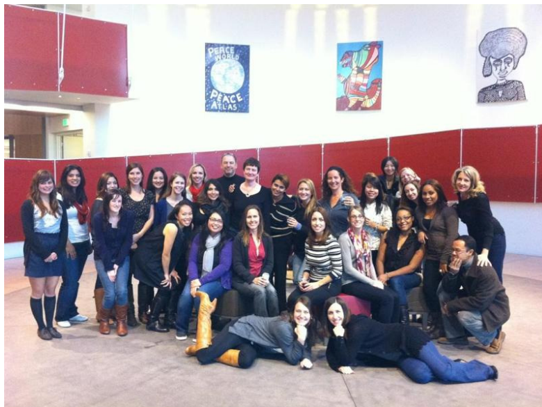
BIA Bay Area Staff at the Ed Roberts Campus in Berkeley

From everyone here at BIA, we wish you and your loved ones Happy Holidays and a Happy New Year!