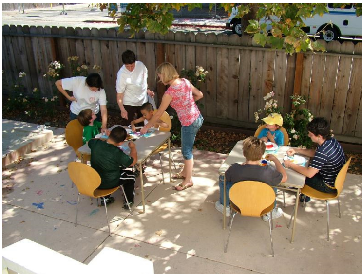
Our Tuesday Explorers group works together on an art project

We were very happy to see many familiar faces as well as to welcome our new Clubhouse friends. We not only learned many new games and used up a huge amount of water balloons but also continued to strengthen our friendship skills.